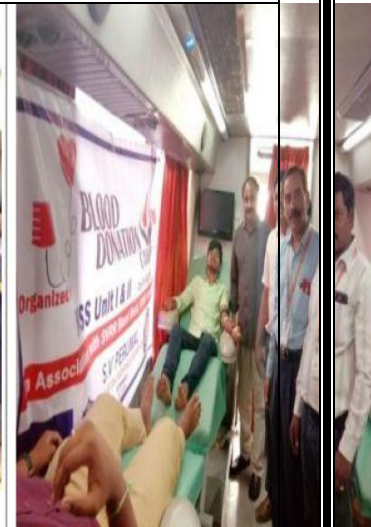
Students donating the blood