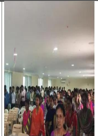
Students and Staff attended to the Jal Diwas Day Celebrations