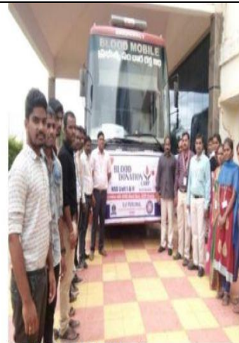
Blood Mobile at Blood donation camp